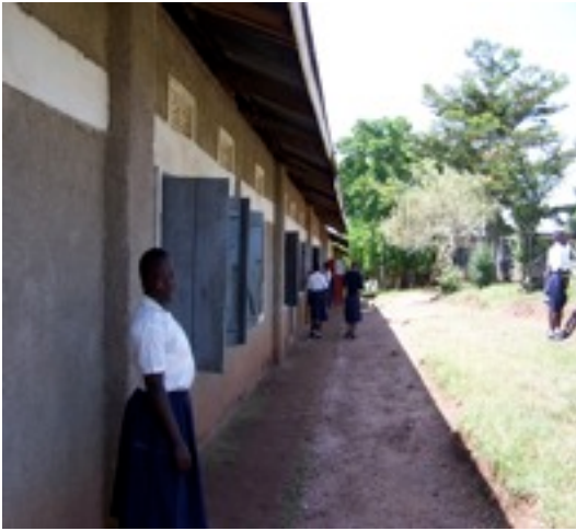
One room per grade level.