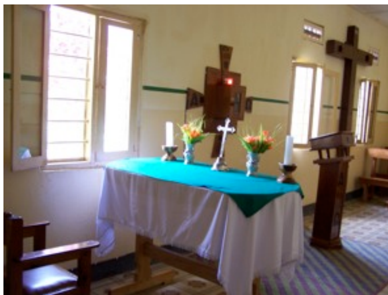
Adoration Chapel St. Kizito Church Kyengeza