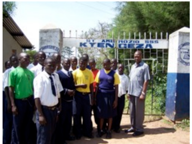
St. Ambrozio, Our Parish Secondary School.