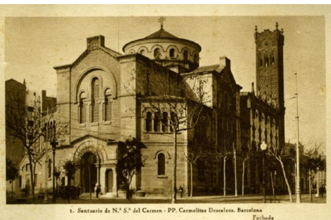
1. Santuario de N.ª S.ª del Carmen - PP. Carmelitas Descalzas. Barcelona Fachada