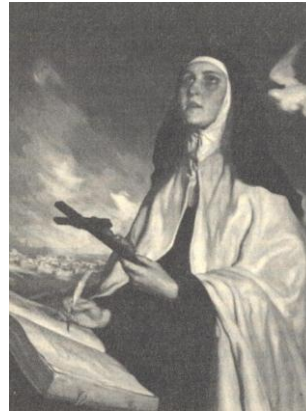
St. Teresa of Jesus

frequently avail of the Sacrament of Reconciliation. We keep the fasting laws of the Church, and we fast on vigils of solemnities and major Carmelite feasts.