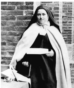
St. Thérèse of the Child Jesus and of the Holy Face

There have always been laypeople who have desired to share in the spiritual life of Carmel. Before Vatican II, these communities were called “Third Order.” Now they are referred to as “Secular Order Discalced Carmelites,” abbreviated as “OCDS.”