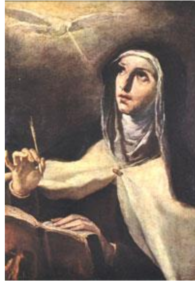
St. Teresa of Jesus

Each day, members of the Secular Order of Discalced Carmelites commit to pray Morning Prayer, Evening Prayer, and—when possible—Night Prayer, from the Liturgy of the Hours . We spend at least half an hour in personal prayer. We do our best to attend daily Mass. Members frequently avail of the Sacrament of Reconciliation. We keep the fasting laws of the Church, and we fast on vigils of solemnities and major Carmelite feasts.