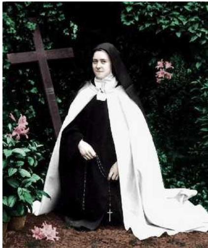
St. Therese of the Child Jesus and of the Holy Face

There have always been laypeople who have desired to share in the spiritual life of Carmel. Before Vatican II, these communities were called "Third Order." Now they are now referred to as "Secular Order Discalced Carmelites," abbreviated as "OCDS."