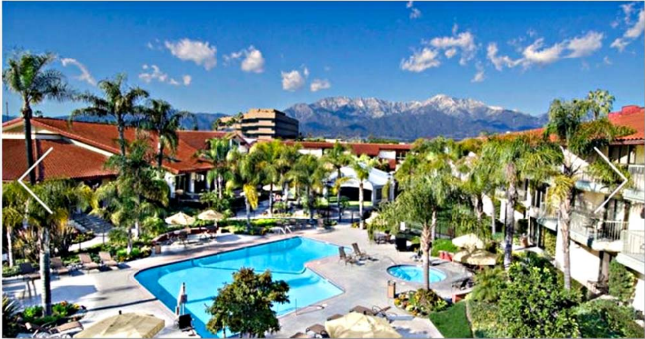
Ontario DoubleTree by Hilton Hotel

This is the fourth Congress we have held at a DoubleTree by Hilton Hotel. Our superlative experiences in Bakersfield, Portland, and San Jose were a major factor in us choosing this beautiful 4-star DoubleTree by Hilton Hotel in Ontario. We were able to negotiate a beautiful rate: $149, with up to four people per room.