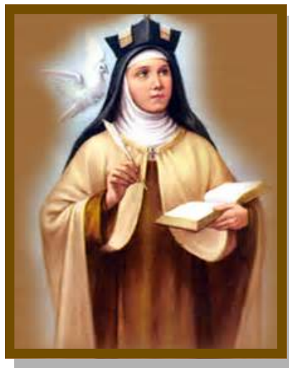
St. Teresa of Jesus